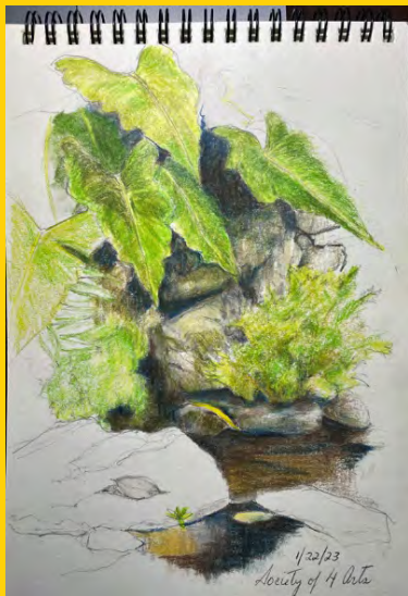
“Lush Foliage”, a colored pencil sketch by Lydia Dardi in the Society of Four Arts, 1/22/23