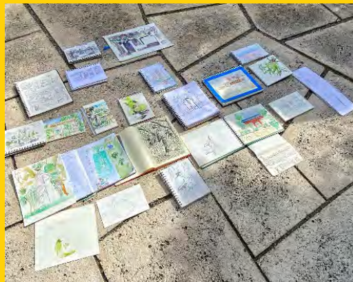
The “Throw Down” of everyone’s sketches for the day – Society of the Four Arts, 1/22/23

Below are some beautiful examples of sketches created by several of our members who have joined Urban Sketchers. Come have some fun with us! Continued on next page >>>>