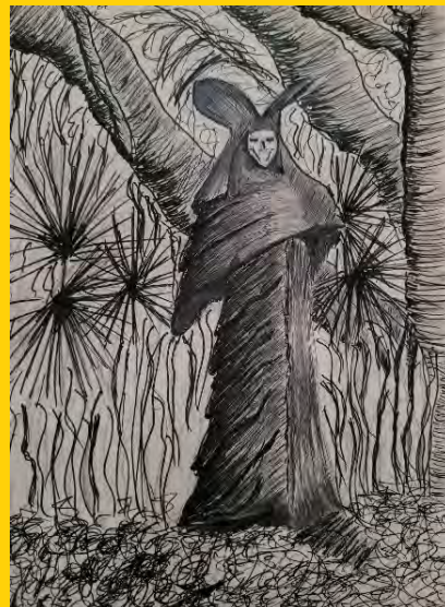
“Sior Maschera” in the Society of Four Arts Sculpture Garden - pen and ink plus Sketch and Wash pencil sketch by Kat Penley, 1/22/23